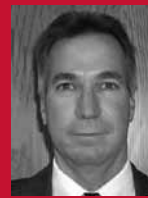
Robert Zahn Chewing & Wilmer Inc.