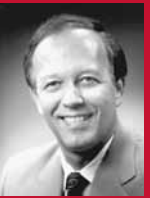
James C. McAtee Electric Power Equipment Company