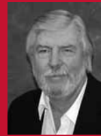
Pepper Snyder Sprig Electric